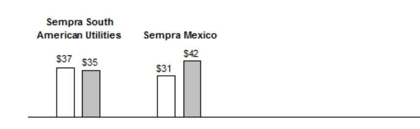
□ Quarter-to-date 2013 □ Quarter-to-date 2014